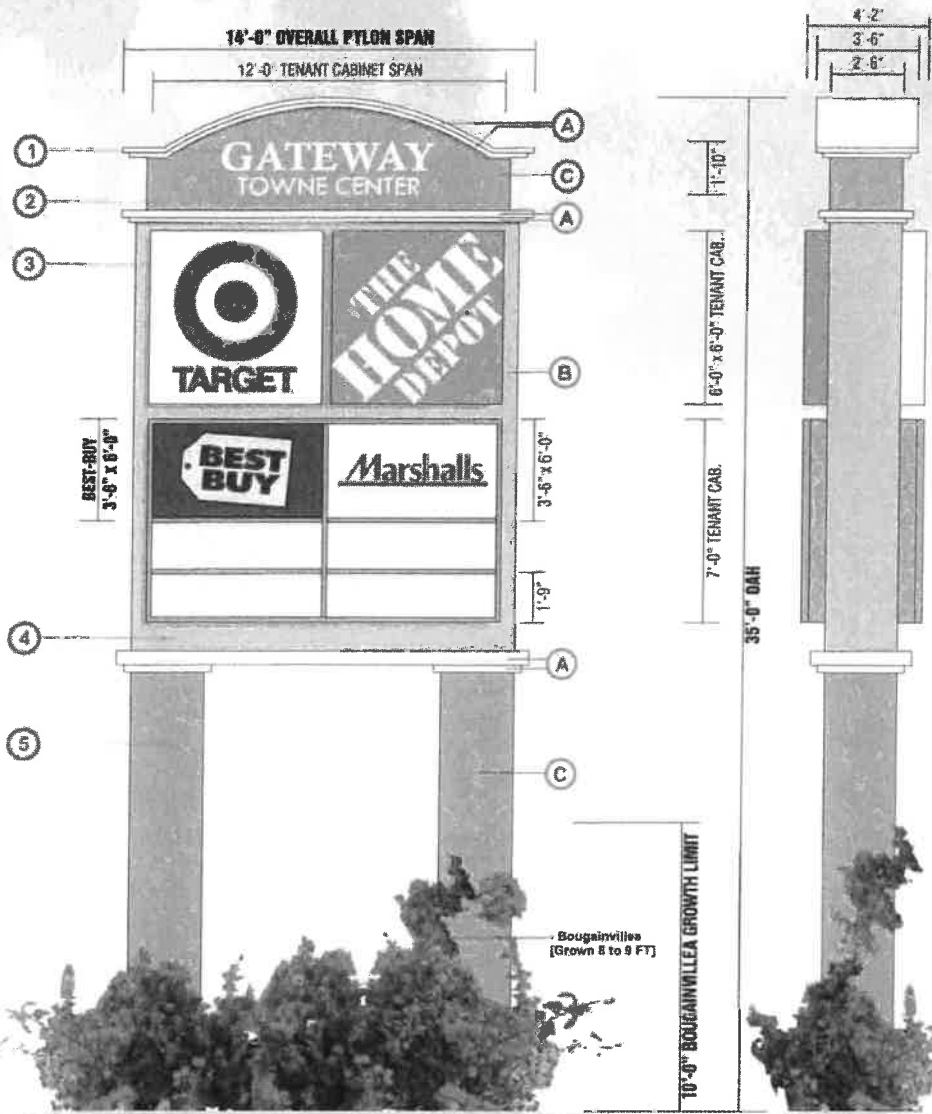
SIGN B MANUFACTURE & INSTALL ONE (1) 35' DIAH DF ILLUMINATED PYLON SIGNS [SCALE: 1/4" = 1'-0"]

NOTE: COLORS REPRESENTED IN THIS DRAWING ARE FOR REPRESENTATION ONLY. THEY CAN NOT MATCH ACTUAL PRINTS BEING USED ON FINISHED PRODUCTS. ALL MANUFACTURERS CAN REPRESENTATIVE COLOR CHARTS TO VISUAL SIGNAGE.