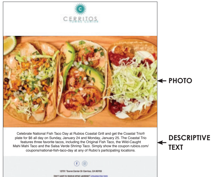
OPTION 2: AD CREATED IN OUR FORMAT