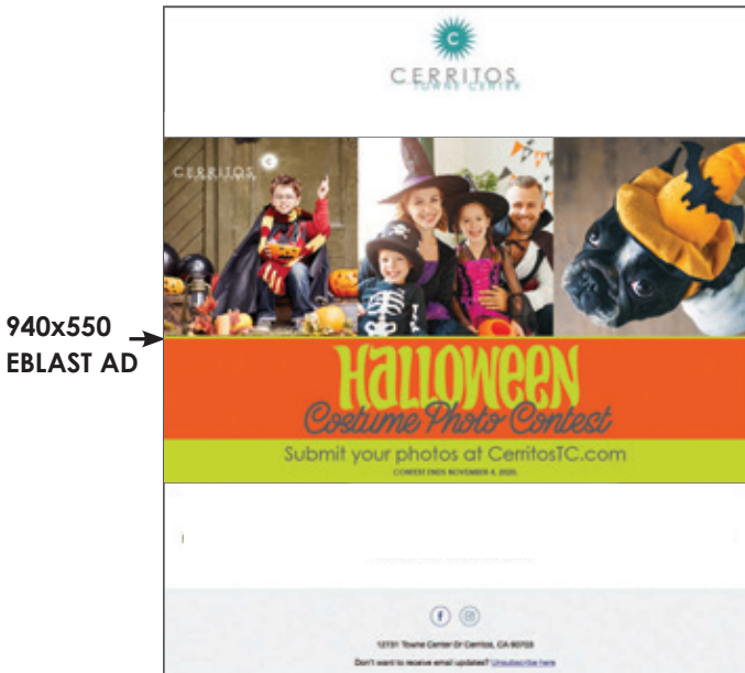
OPTION 1: PROVIDED AD