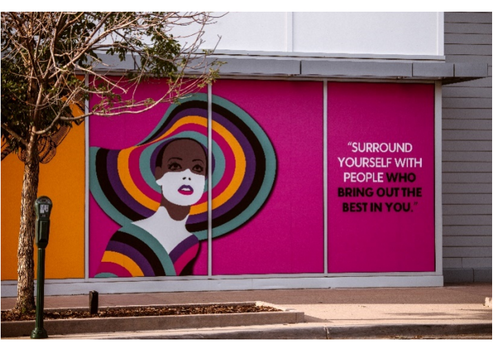
Applied Window Graphics