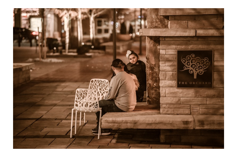
Wall Mounted Plaques