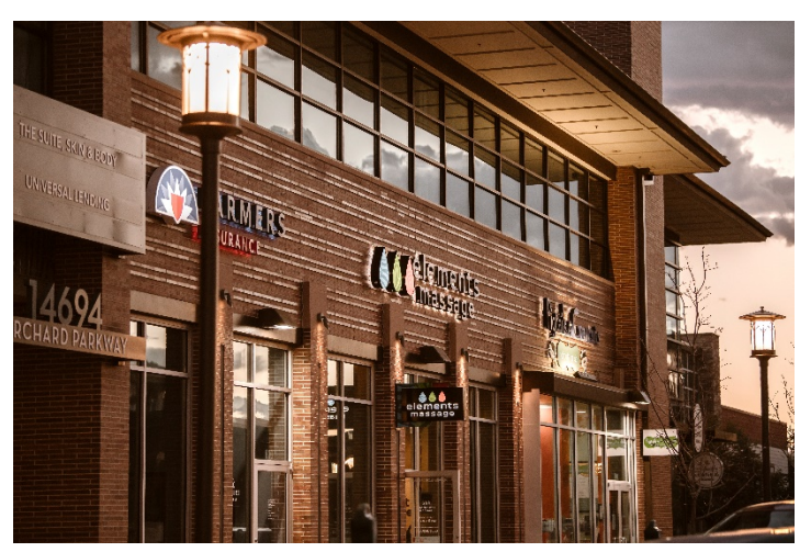
2.14 Tenant Blade Sign Examples